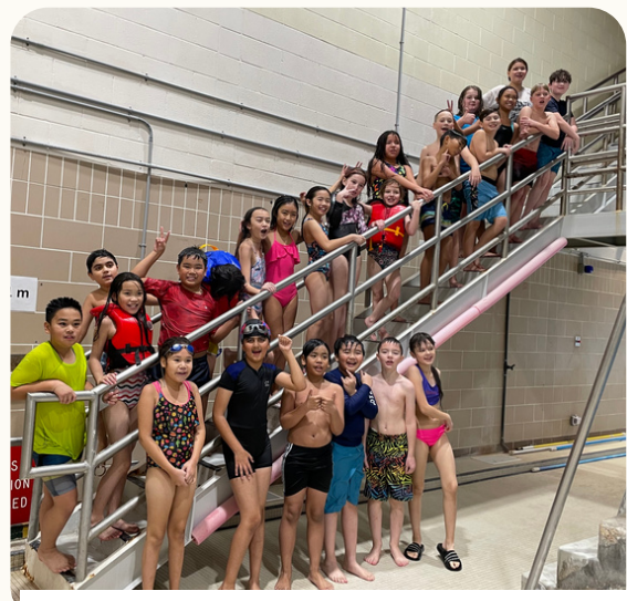
Rm 9 at Swimming