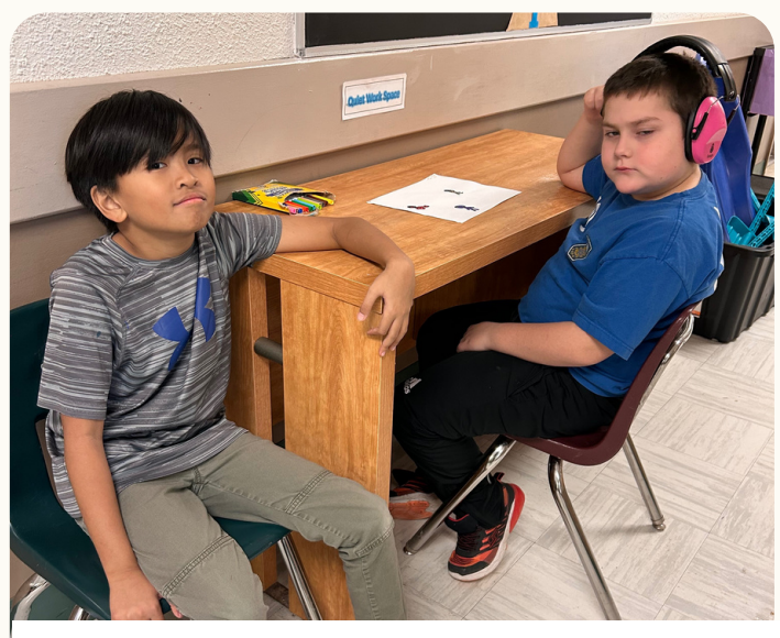
Friends catching up in the hallway