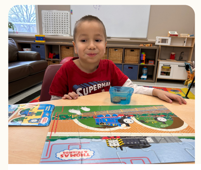
snack and puzzles